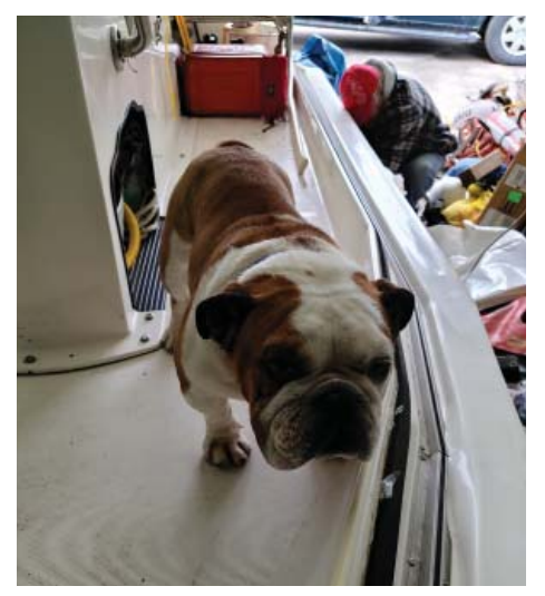
WTD inspector Cont'd on page6